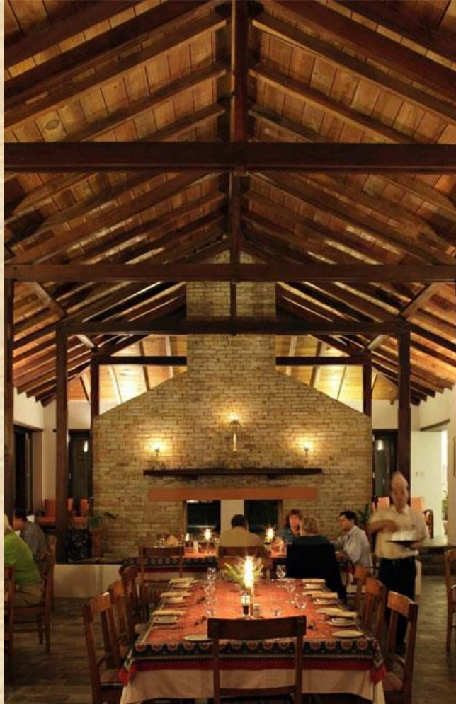
Meal plan: Breakfast, picnic lunch and dinner at TMPL.